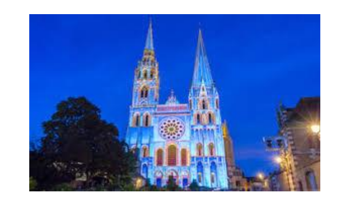
Friday Nogent Saturday en famille Sunday Versailles & Paris Monday More Parisien sights